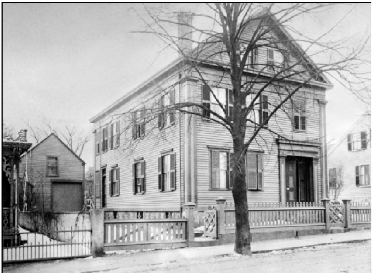
The Borden House.

And what was to come? Answer: Life Linkage of the 16-7v IR Set in multiple forms. First, Borden's 2 nd Pinnacle is a 22-4/(3)/16-7v! By the way, the 22-4 shows extreme organization which would have aided her in planning the murder. Her 3 rd Challenge (Grand) was a 4/(3)/16-7v. Her 4 th Challenge (Crown) was a 4/(3)/16-7v, and her 4 th Pinnacle (Crown) was a 16-7v/(3)/1! These IR Sets generate a quadstack of 16-7 energy and a quintstack of 7v energy. All of this 7 energy began at age 28 and was active until her death at age 66. Notice that her 2 nd Epoch and Crown Pinnacle are both 7v/(3)/1.